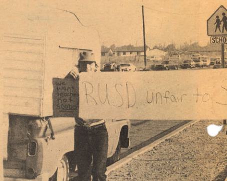
STUDENTS join their teachers. . . but not in class.