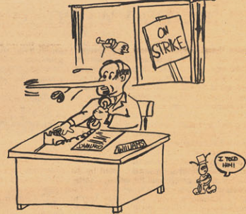
"THE TEACHERS DID NOT WIN?"

You Can Earn A Scholarship Worth Up To $25,000